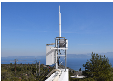
(b) DORIS Beacon DIOB (Starec)