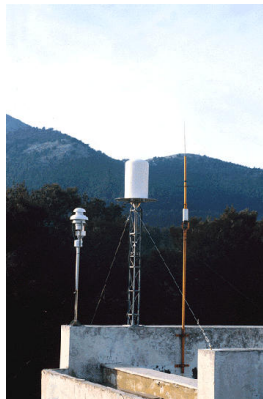
(a) DORIS Beacon DIOA (Alcatel)

Dionysos Satellite Observatory (DSO) has been hosting a DORIS beacon in its facilities since 1989. First setup equipped with an Alcatel antenna (1a), upgraded in May 2006 to Starec (1b).