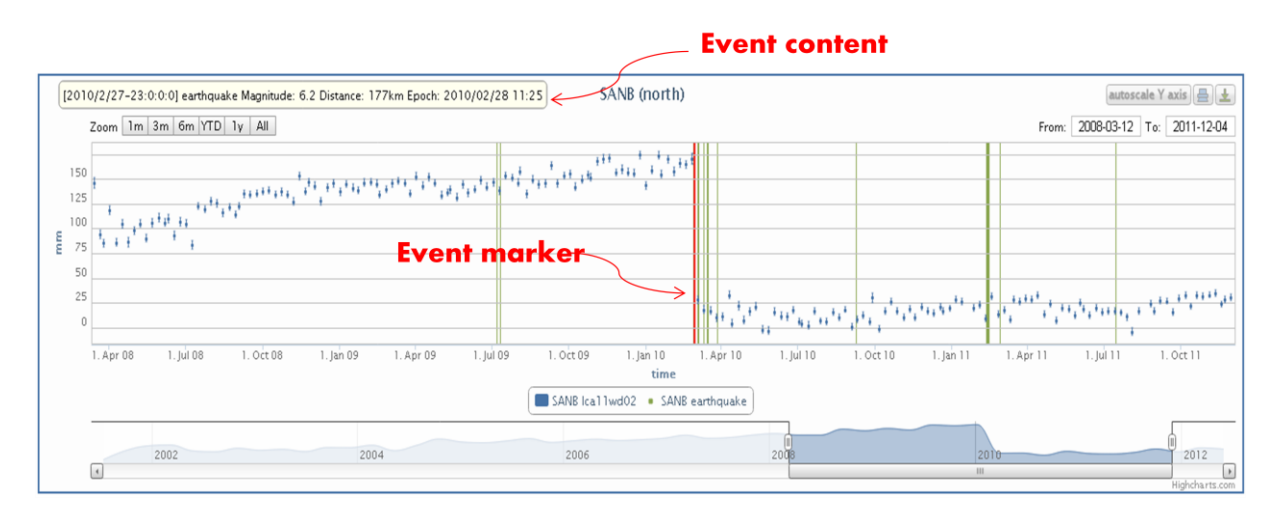
Fig. 2: Example of a position time series displayed with STCDtool: evolution of the North component of the DORIS station in Santiago with discontinuity due to the 2010 Chile Earthquake.

Information about recent earthquakes are also obtained from USGS survey service and added to the station events data available for the Plot tools.