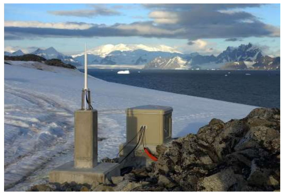
Rothera DORIS station, ROXC, after relocation on Feb. 27, 2018

The BAS team provided valuable technical assistance before and during the operation, so that all work was carried out within the prescribed deadlines. The best location for the antenna was determined in accordance with the DORIS system requirements, in particular to have a clear view of the sky and the required monument stability. The new infrastructure necessary for housing the DORIS equipment is especially appropriate for operation under extreme conditions. A small prefab