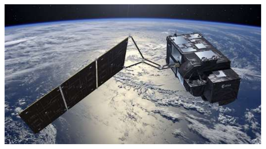
Sentinel -3

Sentinel-3B was launched in April 2018 with a Rockot launcher and is currently in its commissioning orbit. It is in tandem with its twin Sentinel-3A (30 secondes ahead, corresponding to ~223 km). The mid-term topography review was held in the CNES premises on July 11-13 and showed that the satellite, instruments and ground processing are fully in line with mission requirements. The In-Orbit Commissioning Review will be held on October 16-17 at ESRIN. Products will be released widely after this review.