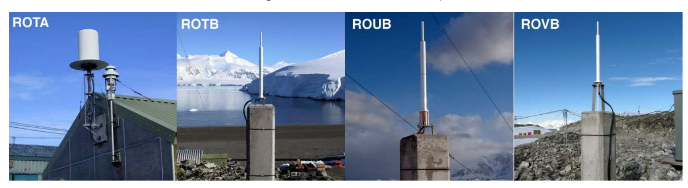
Successive stages in the station evolution from ROTA (1992) to ROVB (2015)

Today, with more of 1200 number of weeks (23+ years!) of recorded data and with only a few short service interruptions, this DORIS station is rated as being among the most active and long-lived of the network.